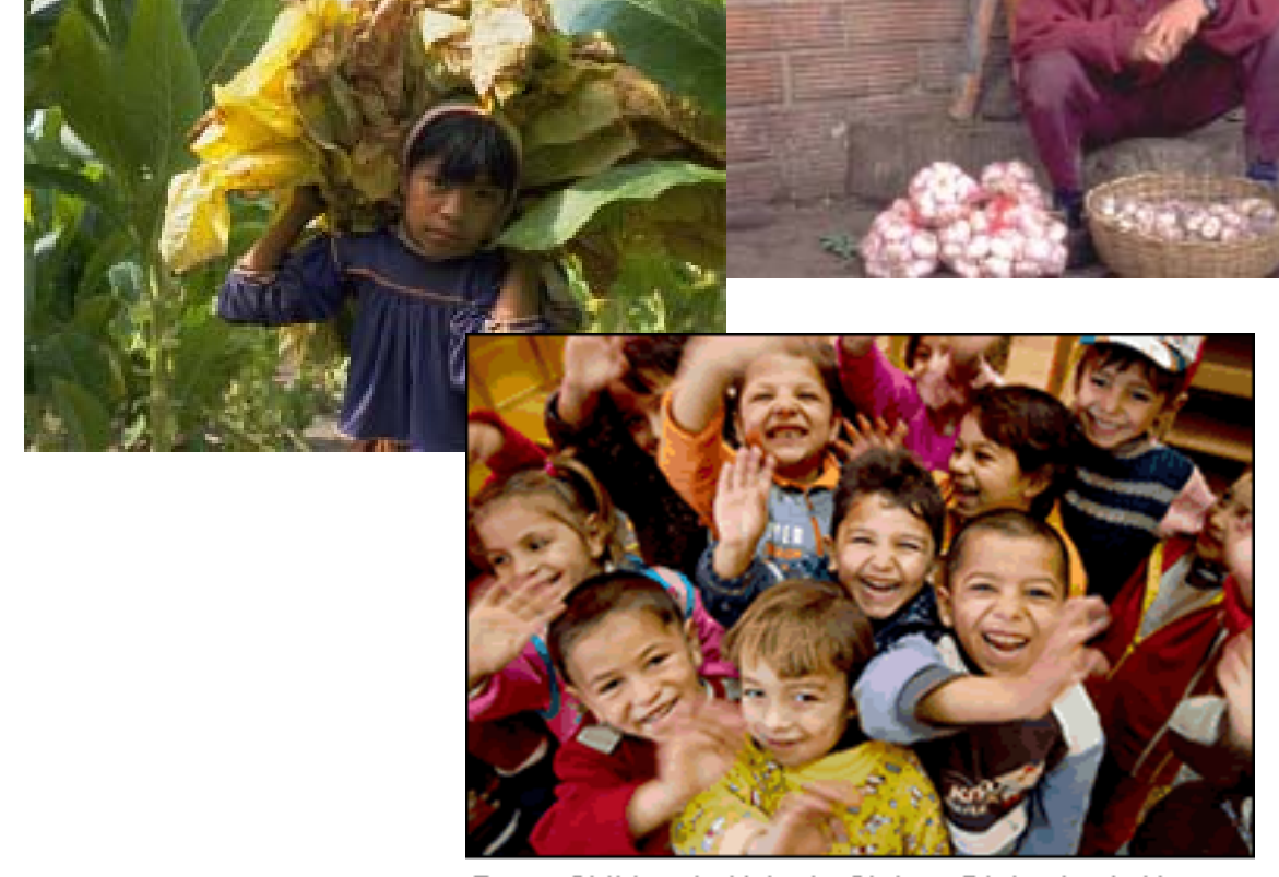
Roma Children in Kolonia GjakoveDjakovica in Kosovo