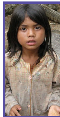
“No one is free when others are oppressed” - Author Unknown